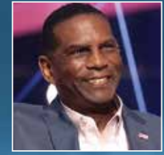
Burgess Owens 🗳