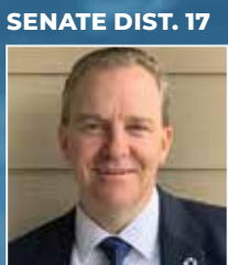
Lincoln Fillmore 65.2% ✓